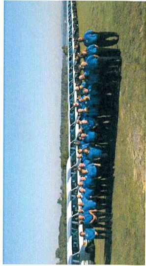
Professionally Trained Drivers

Free language assistance for Limited English Proficient individuals is available upon request